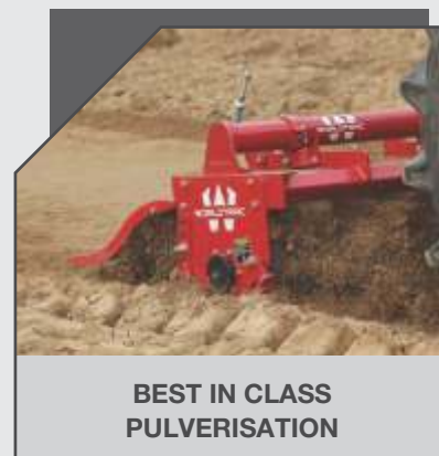
BEST IN CLASS PULVERISATION