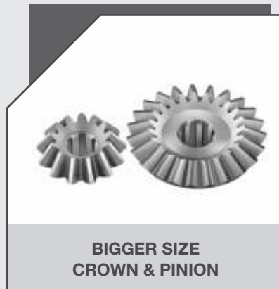
BIGGER SIZE CROWN & PINION