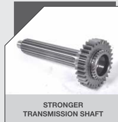
STRONGER TRANSMISSION SHAFT