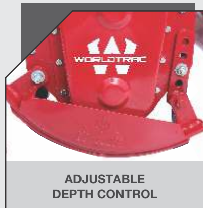
ADJUSTABLE DEPTH CONTROL