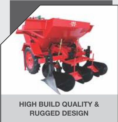
HIGH BUILD QUALITY & RUGGED DESIGN