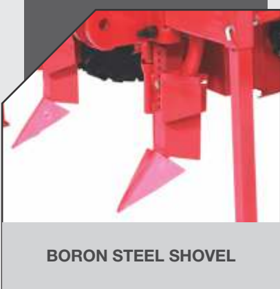
BORON STEEL SHOVEL