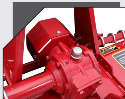
HEAVY DUTY GEAR BOX