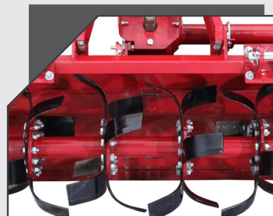
BORON STEEL WEAR RESISTANT BLADES