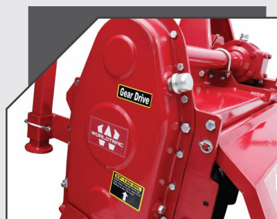
SIDE GEAR DRIVE FOR NOISELESS AND SMOOTH OPERATION