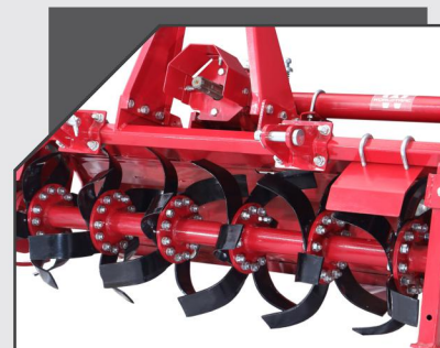
BIGGER FLANGE/ROTOR DIAMETER