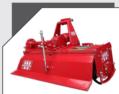
ADJUSTABLE TRAILING BOARD