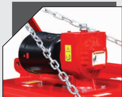
HIGH PERFORMANCE GEAR BOX