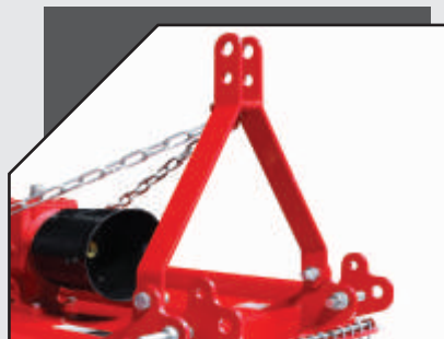
MOUNTED WITH 3 POINTS LINKAGE FOR EASE OF OPERATION