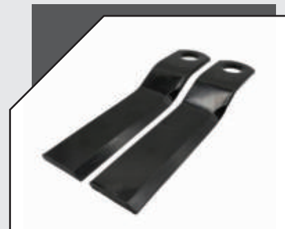
BORON STEEL HEAVY DUTY CUTTING BLADE