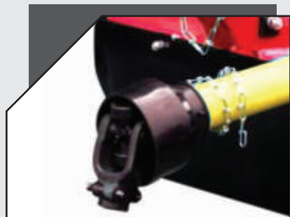
PTO SHAFT WITH SAFETY SHEAR BOLTS FOR EXTRA SAFETY