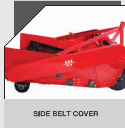
SIDE BELT COVER