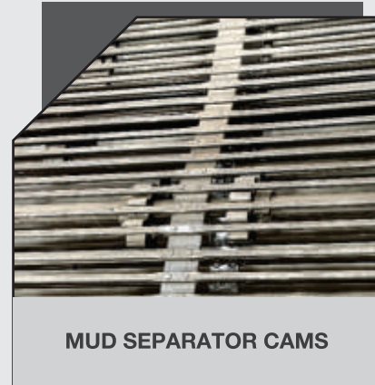
MUD SEPARATOR CAMS