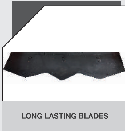
LONG LASTING BLADES