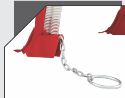
SEED COVERING CHAIN