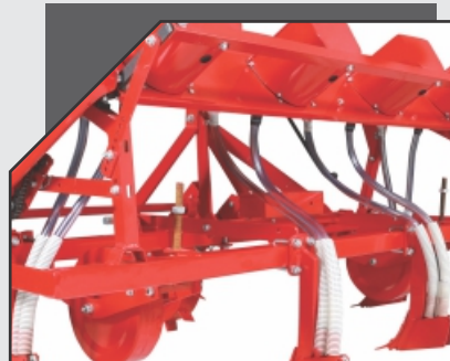
HEAVY DUTY FRAME