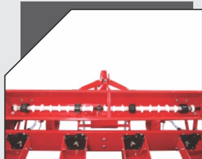
MULTI SIZE SEED METERING DISCS