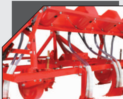
HEAVY DUTY FRAME