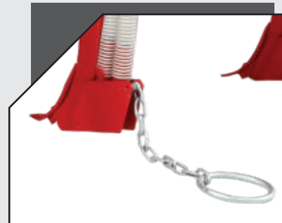
SEED COVERING CHAIN