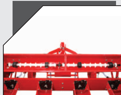
MULTI SIZE SEED METERING DISCS