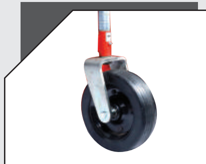
EXTRA WIDE SOLID RUBBER TYRES