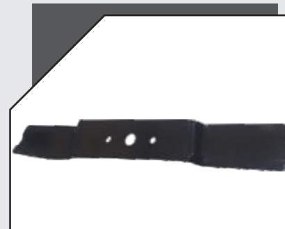
HEAVY DUTY TWISTED CUTTING BLADES