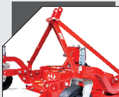
STRONGLY BUILT FRAME