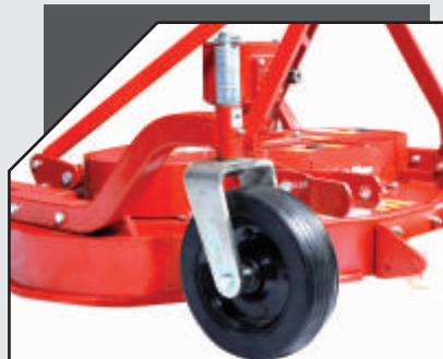
SPACERS FOR HEIGHT ADJUSTMENT