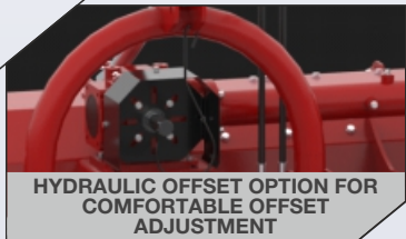
HYDRAULIC OFFSET OPTION FOR COMFORTABLE OFFSET ADJUSTMENT