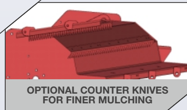
OPTIONAL COUNTER KNIVES FOR FINER MULCHING