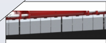
FRONT STEEL CURTAINS FOR PROTECTION AGAINST FLOWING DEBRIS