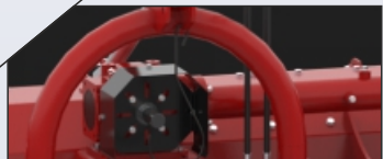
HYDRAULIC OFFSET OPTION FOR COMFORTABLE OFFSET ADJUSTMENT