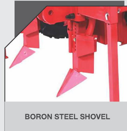
BORON STEEL SHOVEL