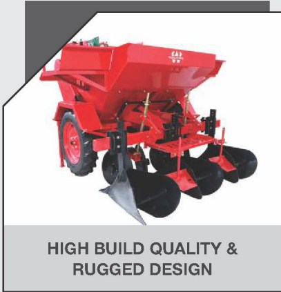
HIGH BUILD QUALITY & RUGGED DESIGN